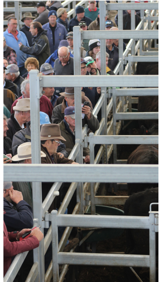
Buyers lining the walkway at CVLX

Contacting CVLX directly makes it easier to identify and address any concerns.